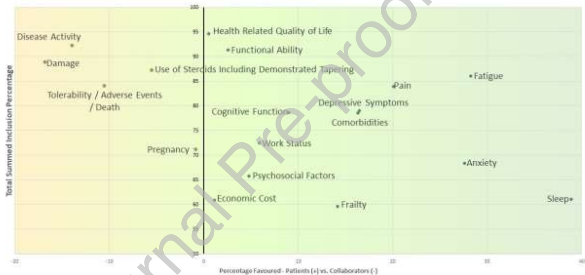
Figure 1. Scatter plot of total summed percentage of inclusion “Yes” responses versus the difference of percentage of inclusion “Yes” responses between the patient group and collaborator group. The green/right side of the graph and green points represent domains that patients preferred, while the yellow/left side of the graph and yellow points represent domains collaborators preferred. The numbers on the X-axis depict the difference in the percentage of “Yes” responses of total responses between the patient and collaborator groups. Domains close to 0 on the X-axis represent domains where patients and collaborators demonstrated similar levels of agreement levels regarding inclusion.