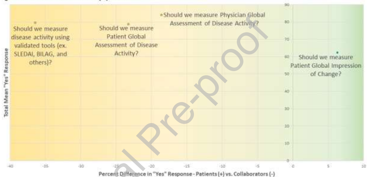
Figure 3. Scatter plot of total summed percentage of “Yes” responses versus the percentage difference in “Yes” responses between the patient group and the collaborator group. The green/right side of the graph and green point represent items that patients preferred (had a higher percentage of “Yes” votes), while the yellow/left side of the graph and yellow points represent items collaborators preferred. Items close to 0 on the X-axis represent having similar levels of agreement between patients and collaborators.